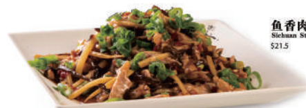
鱼香肉丝 Sichuan Style Shredded Pork $21.5